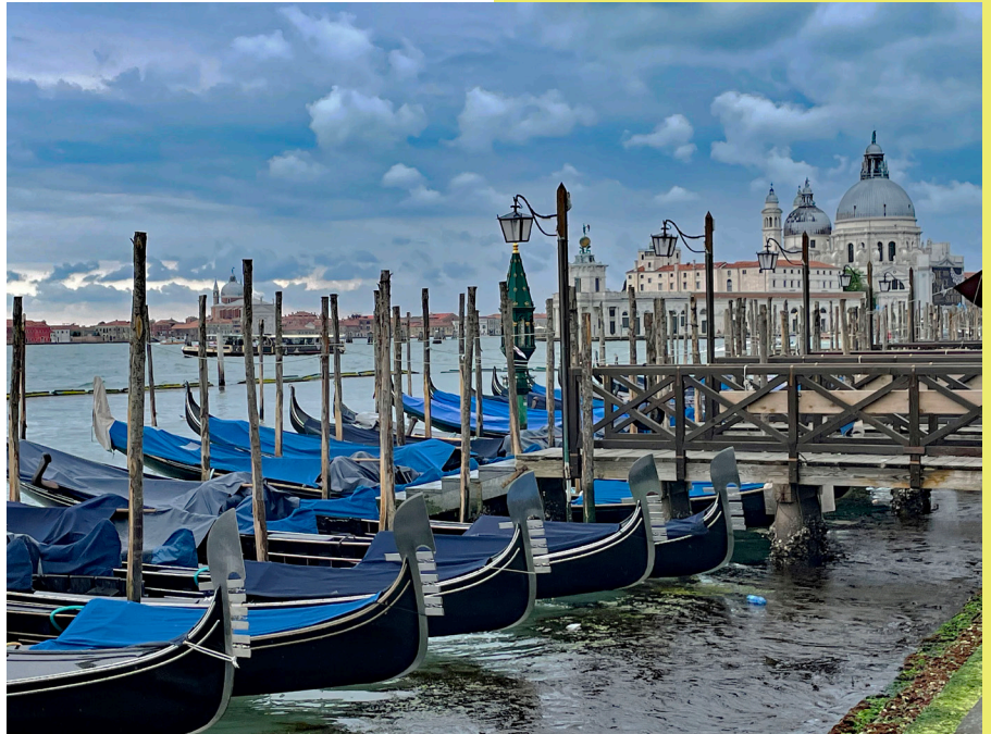
A Venetian harbor, 2024 —.