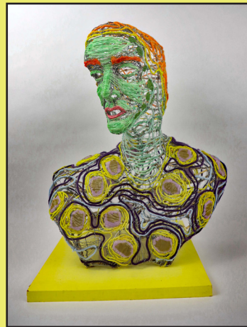
Matt Perez — Sculptures