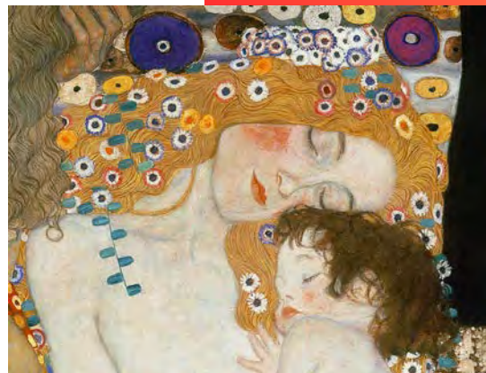
Gustav Klimt, Mother and Child, detail from The 3 Ages of Woman, 1905, Oil