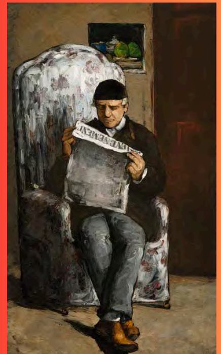
Paul Cezanne, The Artist's Father Reading, L'Evenment 1886, Oil on Canvas