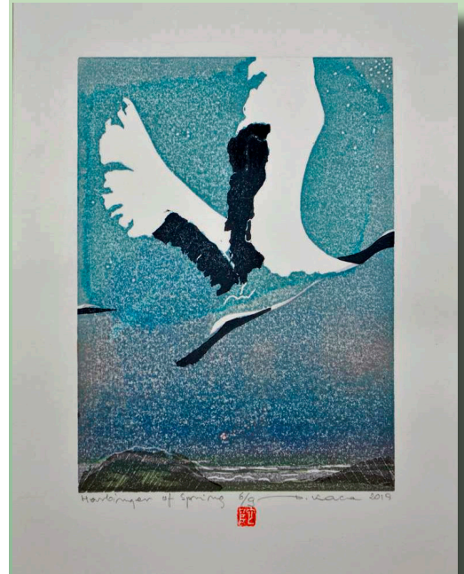
Harbinger of Spring Dariusz Kaca - Poland 2019 Printmaking