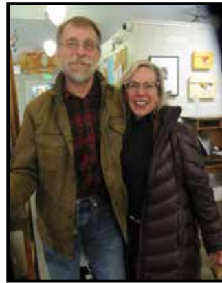
It was a welcome change to see new faces in the gallery during the AAE's Community Day.

Thank you to everyone who supports Valley Art. You are irreplaceable.