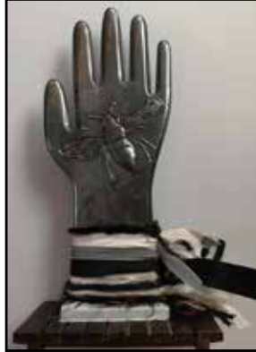
Both images, Barb Sedgwick

malleable and therefore I can achieve the greatest detail in the texture and design.