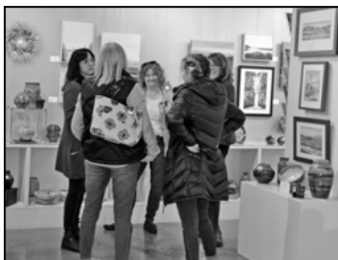
Valley Art appears to be the place to catch up with friends.