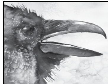
Both bird images, Lieta Gratteri

She says, “The result is a textural mark, almost like a ‘tidemark.’ Some artists don't want blooms in their paintings. I feel like sometimes they are meant to be there, and sometimes you can control them depending on the amount of water that's used.”