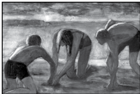
Beach Play, Kathleen Buck

KATHLEEN BUCK attempts to capture the essence of people and animals through their gestures and movement, and their interactions with their environment. The dynamic tension created by their physical movements can be woven into the background to create a strong composition.