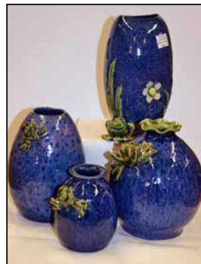
Hogwash Pottery's gorgeous blue jars with bright green frog friends.

will be talking about — and showing how — making wreaths that birds can eat.