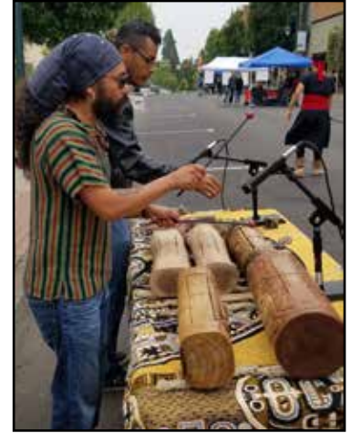
Huehca Omeiyocan played during Chalk Art.

Thank you to our main sponsors Woodfold MFG. Inc.; Ballard Town Chiropractic Clinic; Forest Grove High School; City of Forest Grove — Engineering, Parks, Street depart-