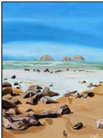
"Oceanside Clarity" by April Hoff.

Saturday, Nov. 11, from 6 to 8:30 p.m. will be a Coloring Book Night. Feel free to bring coloring books of your own or purchase a Forest Grove-themed coloring book from a visiting Public Arts Commission representative. Crayons and some markers will be available.