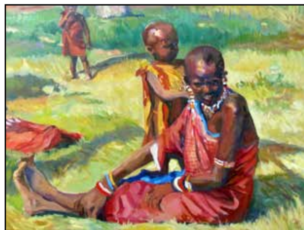
Masai Family, Tanzania