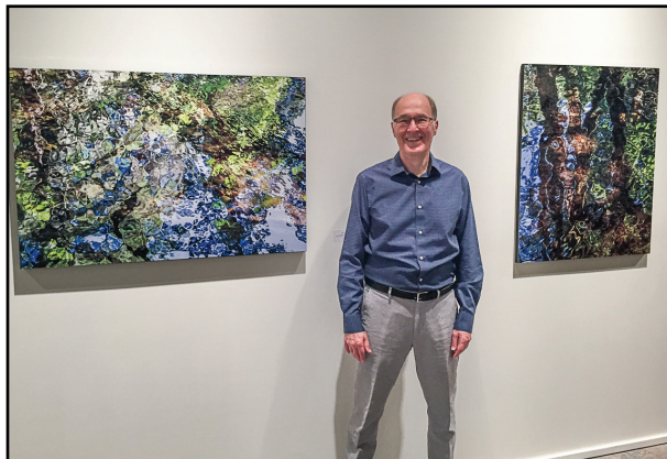
Gales Creek