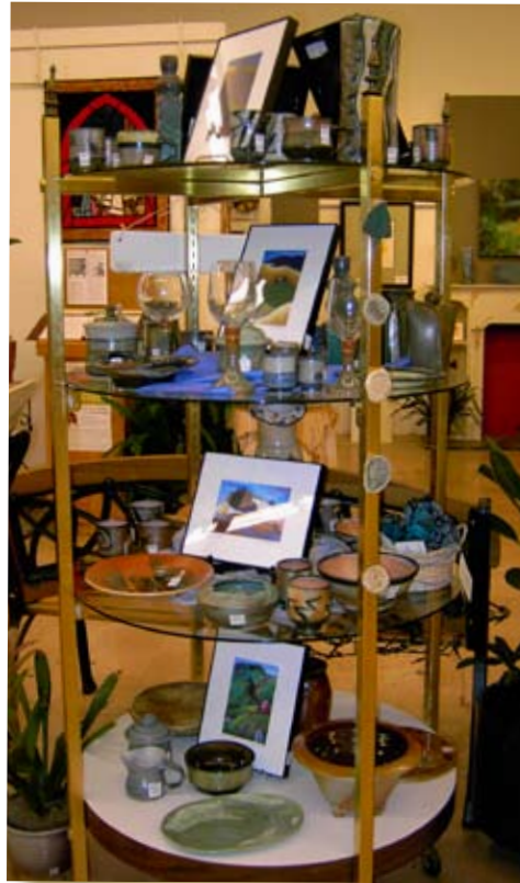
Work by many artists combined to make the 2006 show one of variety, beauty and elegance. What a treasure we have in our gallery! Thank you to all our artists and volunteers for your donations of time and talent.

Annual Artist Event 2006: Valley Art has the best artists!