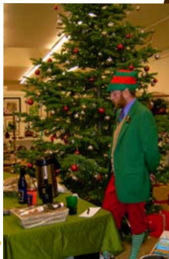
Left, the "Sake Elf" from Sake One, stands ready (in front of the beautiful Christmas tree) for the next taste-tester during First Wednesday on Dec. 6 in Valley Art's gallery.