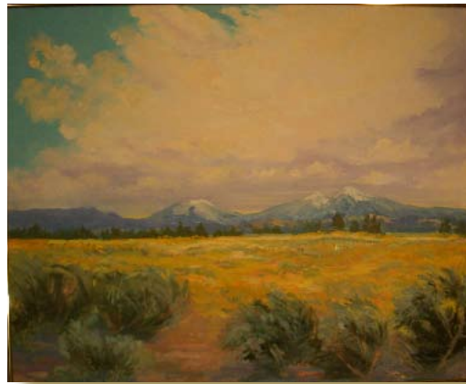
Snow-topped mountains – with white clouds fanning out into the blue sky from behind – are edged with golden fields, while green trees anchor the bottom of this painting.