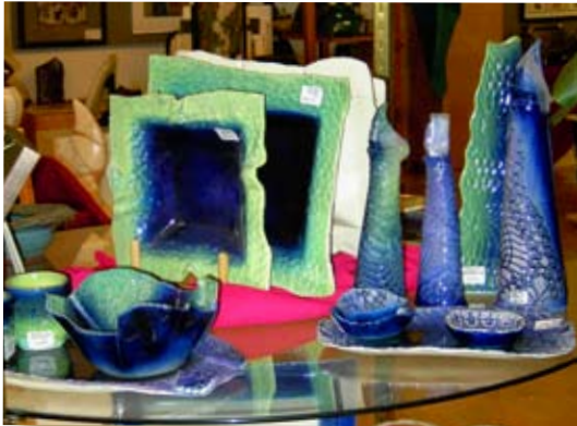
The blues and greens of these shimmering plates (above) have to be seen to be appreciated. Below is a luscious fused glass bouquet in purple, green and pink.

Happy New Year to everyone. Now resolve to buy some real art for your walls at Valley Art!