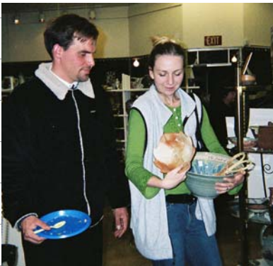
Which bowl to give away and which bowl to keep? We thank these members for their delicious apple pie dessert!