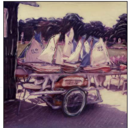
Paris Sailboats - JoAnn Boatwright

JoAnn continues to shoot 35mm film and enjoys digital photography, but is still enchanted with the Polaroid manipulation process. She uses vintage Polaroid SX-70 cameras and a variety of tools, such as keys, paper clips, bamboo skewers and, her favorite, a crochet hook, to move the emulsion before it sets up. All of her work is done by hand; no computer process is involved.