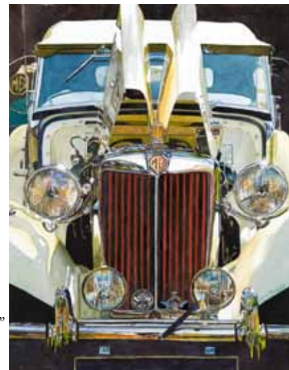
Shown is "Cars I'll Never Own, #9"